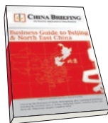
Beijing and Northeast China