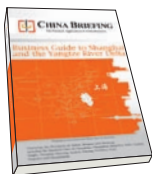
Shanghai and the Yangtze River Delta

The definitive regional business guides covering all China, including local demographics, infrastructure, development zones and available investment incentives.