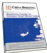
Greater Pearl River Delta