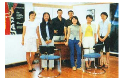
Congratulations to Fastnet Asia Ltd - new RO in Shenzhen.