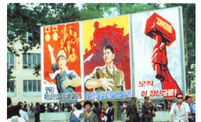
Agitprop posters everywhere in the streets reminiscent of China in the 1950’s.