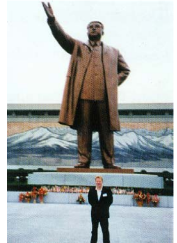
Statue of Kim Il-Sung, Father of North Korea and a revered icon.