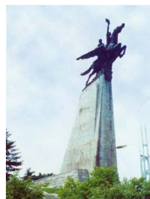
Pyeongyang - a city full of symbolism