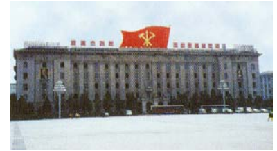
Foreign Ministry, Pyongyang

Like China, the DPRK encourages manufacturing and export, specifically in the Rajin-Sonbong Economic & Trade Zone. Sale of