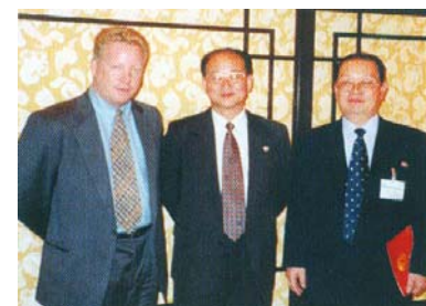
DPRK Hong Kong Consular Officials - very helpful.