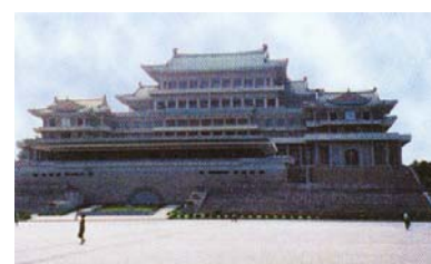
Pyongyang Library & Theatre - built and donated by Beijing