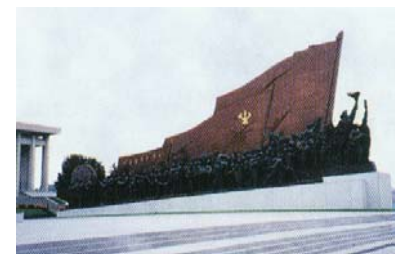
Memorial to Japanese War