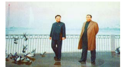
The Dear Great Leaders